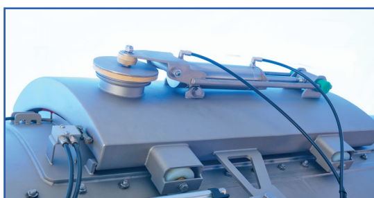
Valve in the cover closed

The valve closes automatically when the tank rotates. The process parameters (pressure at which the valve closes, etc.) are freely adjustable. Due to its design (freely accessible diameter DN100), the valve is easy to clean.