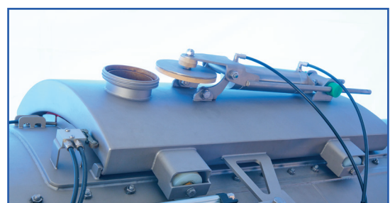
Valve in the cover open