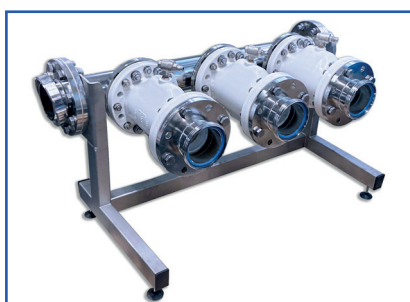
Must separation with three valves

If the must pump control option is also chosen, the juice that has already drained off is pumped to the last fraction used before switching over.